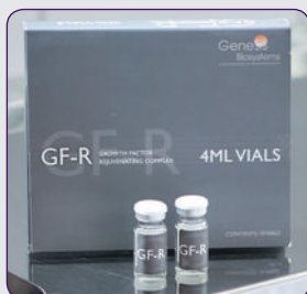
Epidermal Growth Factor Fibroblast Growth Factor